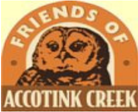
Friends of Accotink Creek