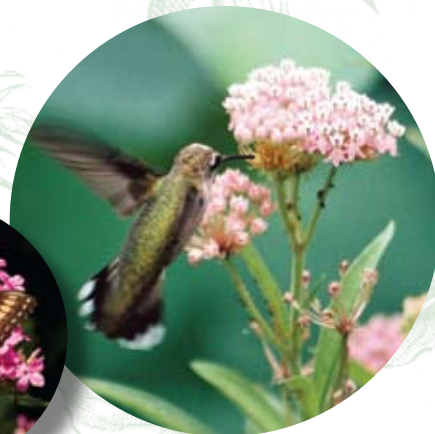
Humming Bird on Swamp Milkweed