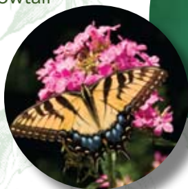
Tiger Swallowtail on Phlox

Flowers: Native flowers bloom throughout the year and attract a variety of pollinators