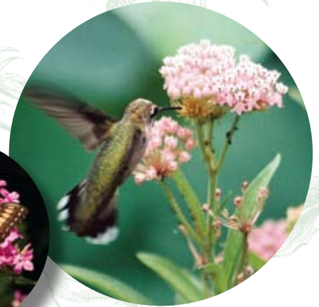
Humming Bird on Swamp Milkweed