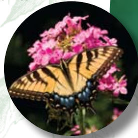
Tiger Swallowtail on Phlox

Flowers: Native flowers bloom throughout the year and attract a variety of pollinators